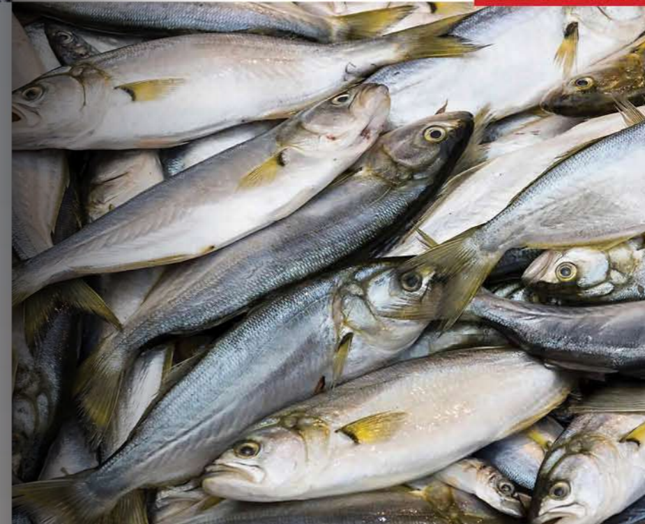
Blue fish ( Pomatomus saltatrix )