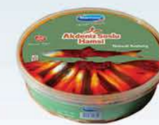
Anchovy with Mediterranean Sauce