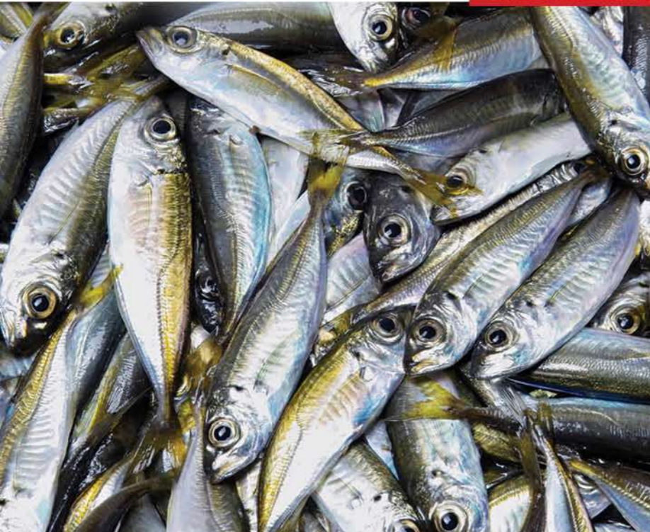
Horse Mackerel ( Trachurus trachurus )