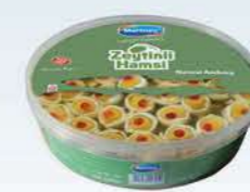
Anchovy with Olives