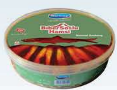
Anchovy with Pepper Sauce