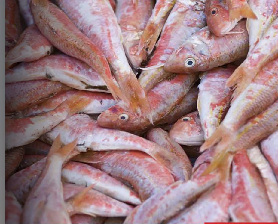
Red Mullet ( Mullus barbatus )