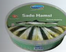
Natural Marinated Anchovy